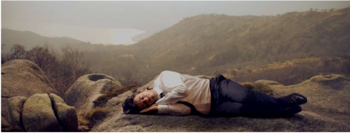
“Comfortable with Our Discomfort”