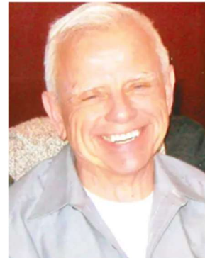
August 6 1935 – February 22, 2025