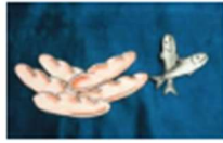
"Picnic and a Boat Ride"