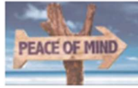
"Protecting Our Peace"